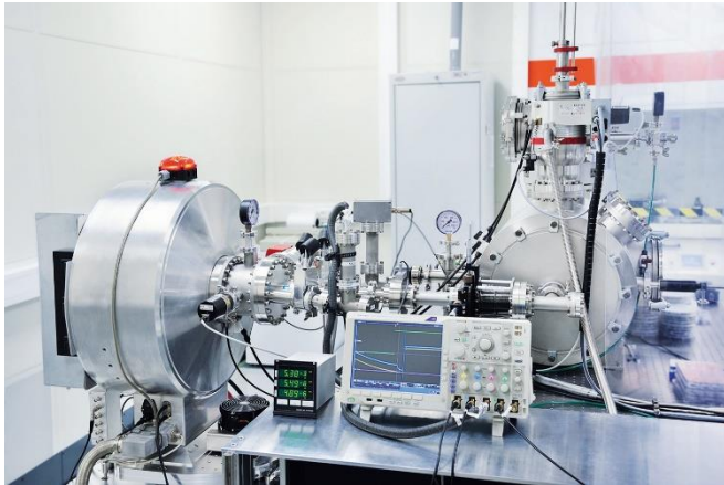
Image 1: At Fraunhofer ILT, a laboratory system for EUV has been built to process wafers with a diameter of up to 100 mm.