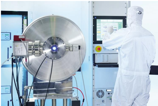
Image 2: The EUV source at Fraunhofer ILT delivers 40 W at 13.5 nm (+/- 1 percent bandwidth).